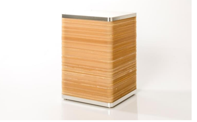
The battery stack can be used for different stationary applications.

The prototype shown here is based on an aqueous cell chemistry and acts as a battery storage device for stationary applications. The device is inherently safe and in accordance with the objective (i.e. non-mobile applications) has not been optimized with respect to energy density but rather with respect to the lowest total cost of ownership (TCO). Therefore, the sustainable and inexpensive materials were used for the manufacture. With its flexible architecture, the unit can be adapted to meet special requirements (e.g. high power). Fraunhofer ISE provides services in designing, constructing, testing and certifying electrochemical storage devices.