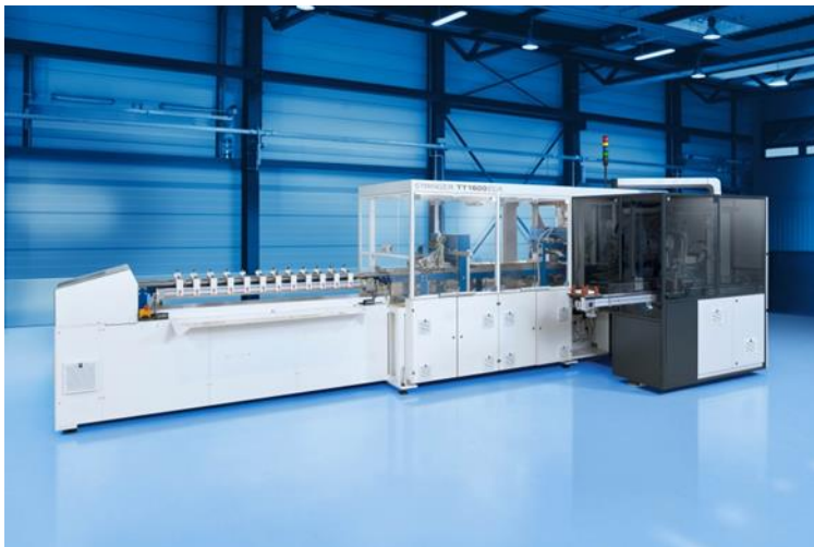
Stringer using adhesive technology developed by the company teamtechnik for interconnecting heterojunction solar cells in series production.

The teamtechnik Maschinen und Anlagen GmbH is one of the international market leaders for innovative production technology, assembly and functional test systems. The company, based in Freiberg, Germany, focuses on developing custom automation solutions for the automotive, solar and medical technology, in which it is a recognized technology leader. Founded in 1976, teamtechnik now has production sites in Germany, Poland, China and in the United States. With over 1000 employees worldwide, the systems manufacturer achieves a turnover of €170 million.