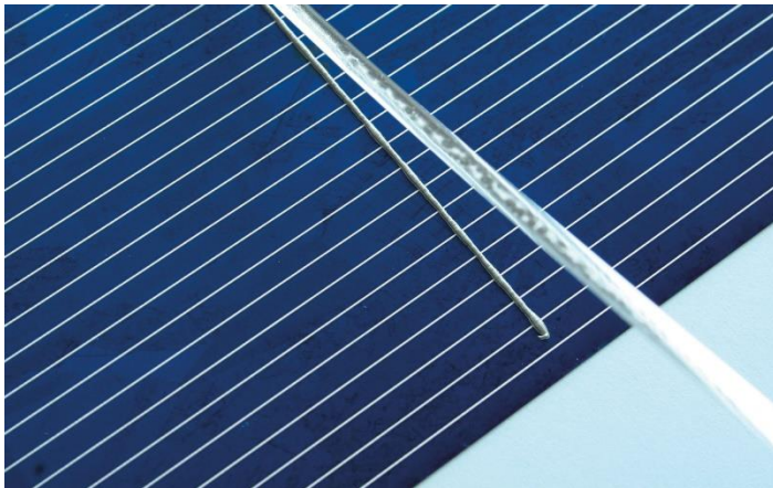
Solar cell with conductive adhesive and cell interconnection.

The Fraunhofer-Gesellschaft is the leading organization for applied research in Europe. Its research activities are conducted by 72 Fraunhofer Institutes and research units at locations throughout Germany. The Fraunhofer-Gesellschaft employs a staff of 25,000, who work with an annual research budget totaling more than 2.3 billion euros. Of this sum, 2 billion euros is generated through contract research. More than 70 percent of the Fraunhofer-Gesellschaft's contract research revenue is derived from contracts with industry and from publicly financed research projects. Branches in Europe, the Americas and Asia serve to promote international cooperation.