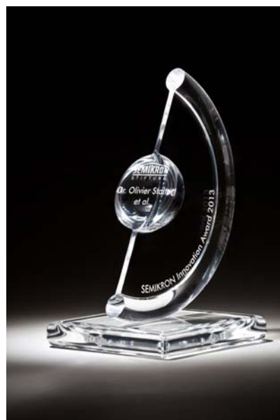
The SEMIKRON Innovation Award 2013

Text: Solar Consulting GmbH, Freiburg Phone +49 761 380968-0 info@solar-consulting.de