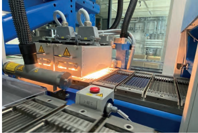
Infrared soldering unit of the stringer in the Module-TEC of Fraunhofer ISE for low-temperature soldering with lead-free solder alloys.