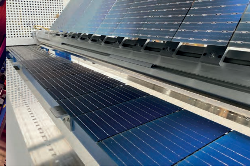
Solar cell strings (front side and rear side) on the stringer transportation belt after lead-free soldering