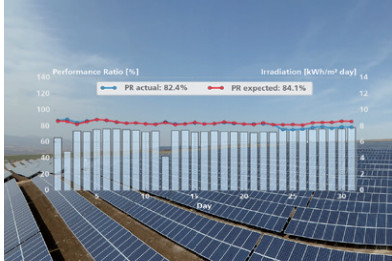
Comparison of actual and expected performance ratio.