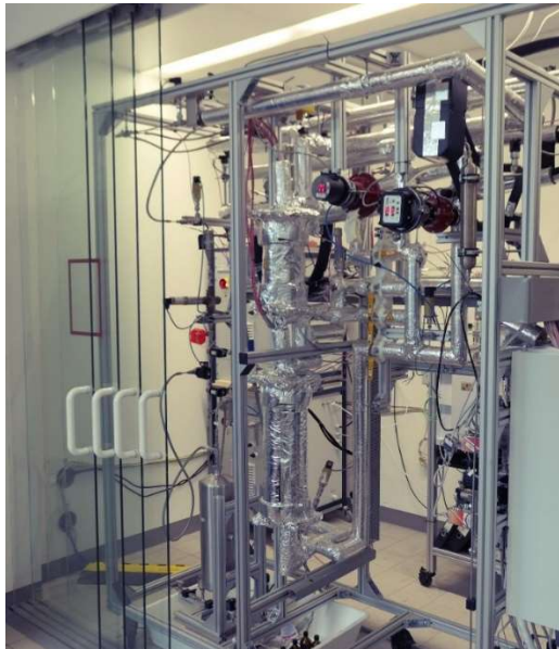
Mini-plant for converting blast furnace gas into methanol.