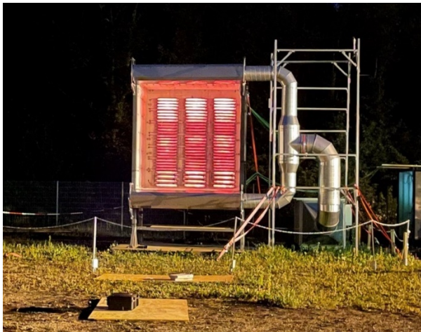
The air wall was tested and optimized using a regular size receiver test setup.