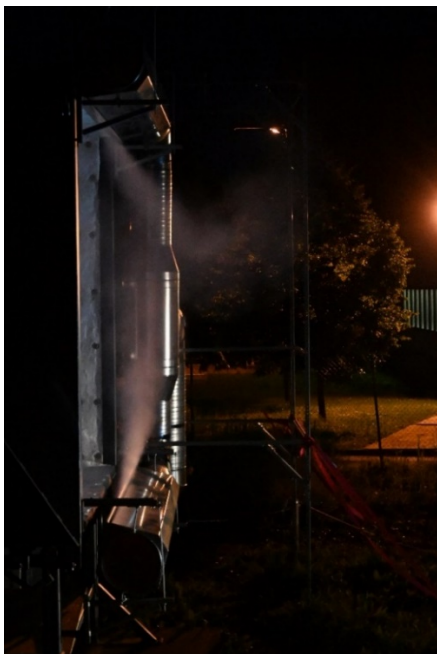
The airflow separates the hot inside of the receiver (left) from the outside air.

The Fraunhofer-Gesellschaft based in Germany is the world's leading applied research organization. Prioritizing key future-relevant technologies and commercializing its findings in business and industry, it plays a major role in the innovation process. A trailblazer and trendsetter in innovative developments and research excellence, it is helping shape our society and our future.