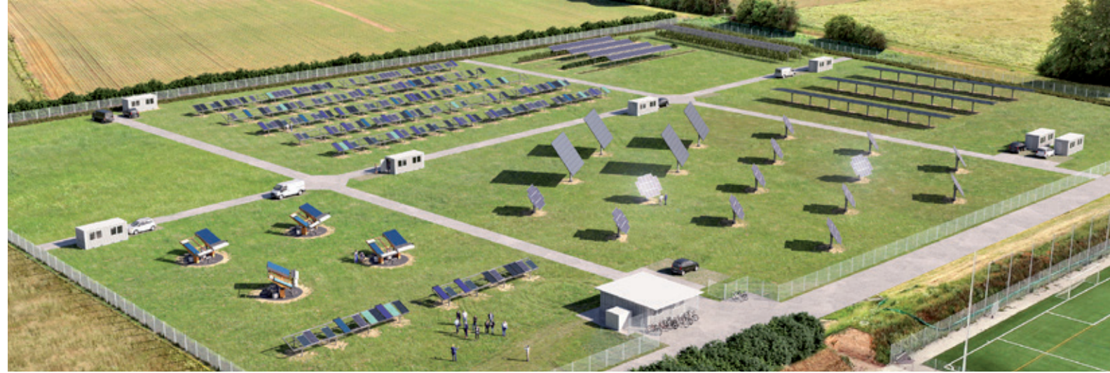
Visualization of the Solar TestField with different solar system setups in Merdingen near Freiburg, Germany.

the expected degradation and service life during operation. Innovative products and prototypes of a variety of different solar technologies will be tested: