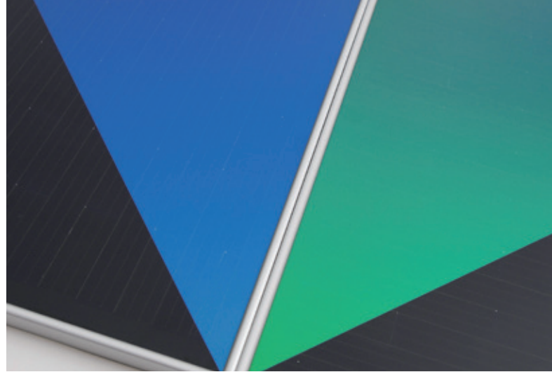
The matrix of shingle solar cells is almost invisible beneath the Morpho-Color® coating.