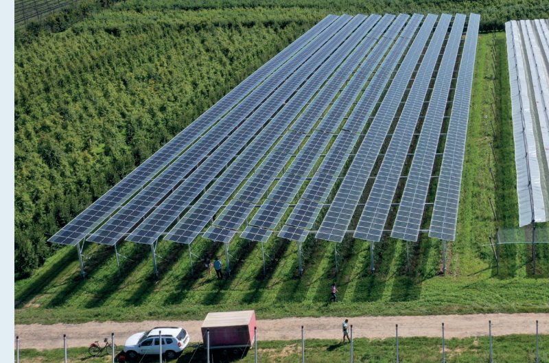
Apple orchard with agrivoltaic system in Gelsdorf, Germany with 258 kW p installed capacity.